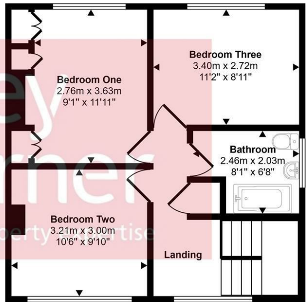
First Floor Approx 47 sq m / 501 sq ft

This floorplan is only for illustrative purposes and is not to scale. Measurements of rooms, doors, windows, and any items are approximate and no responsibility is taken for any error, omission or mis-statement. Icons of items such as bathroom suites are representations only and may not look like the real items. Made with Made Snappy 360.